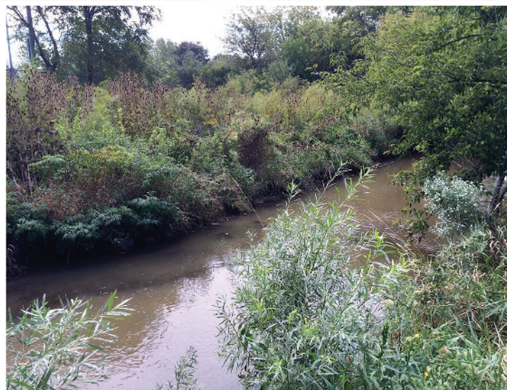
The Flint Creek Dreamway before its restoration.