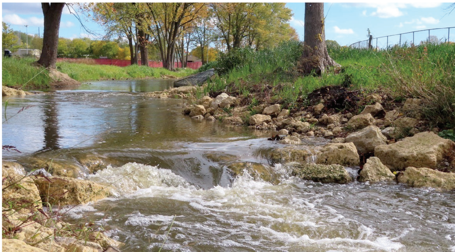
The western end of the Flint Creek Dreamway after restoration on Barrington 220 property.