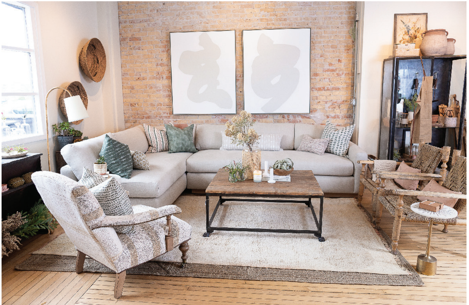
A living room vignette at Kate Marker Home in downtown Barrington.