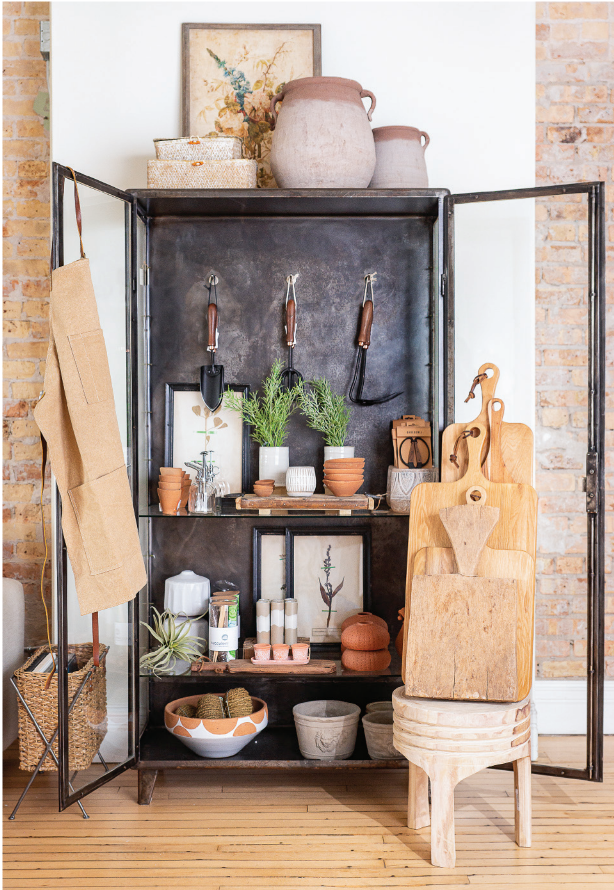
A garden shed display at Kate Marker Home. Gardeners will appreciate the assortment of garden shears and other hand-sized tools, planters, and garden-in-a-bag products.