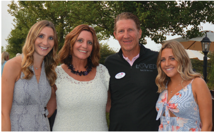
The Butz Family