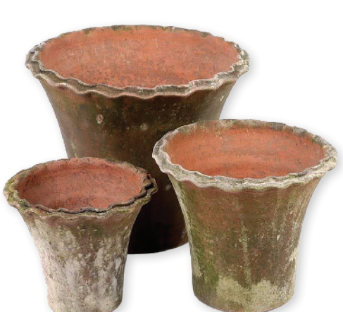
PIE CRUST PLANTERS A planter with patina adds depth and character to your space. Pasquesi.com

SANDALS Simple leather sandals with pretty details are timeless and will go with all your summer dresses. Matisse at Tuckernuck.com