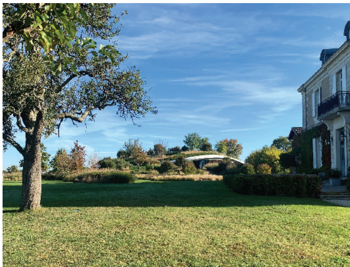
A forested roof at Château Cheval Blanc.

Ramond-Lafon, Pierre was the managing director for Château d'Yquem. The blend is 80% Semillon and 20% Sauvignon Blanc, averaging 35 years old. We tasted the 2015 vintage and were very impressed.