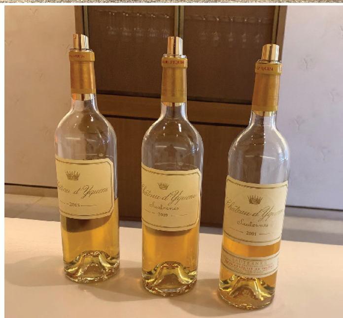
The three wines tasted at Château d'Yquem.

I believe Haut-Bailly represents one of the greatest values in outstanding Bordeaux wines. The 2008 was from the more classical vintage and is more