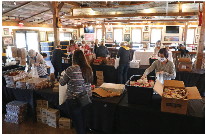
Packs of Plenty serves children in need within the Barrington 220 schools area.