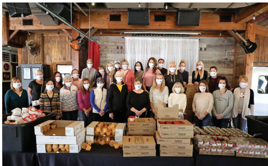
Volunteers pack backpacks of food at a large space graciously provided by Moretti's.

You Can Help! A Virtual Holly Ball Event this year will help the charity meet its goals as an essential needs charity. To donate or sponsor, visit barringtonchildrenscharities.com