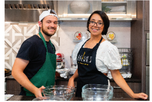
Essential Kitchen served plant-based Mexican cuisine.