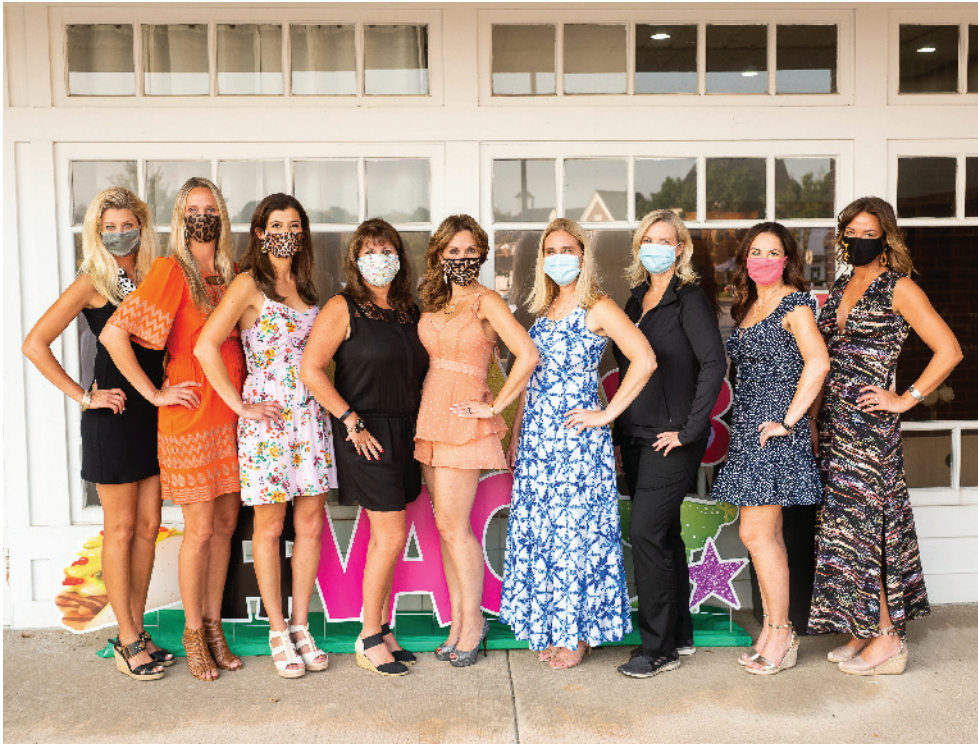
Gathering at the One Life Kitchen in Barrington.