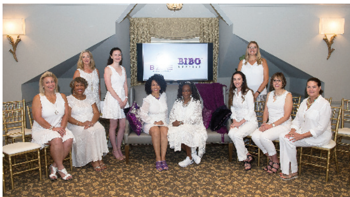
Women business owners shared their stories.