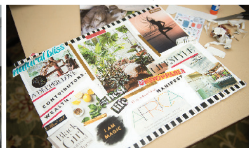
Retreat attendees made vision boards.