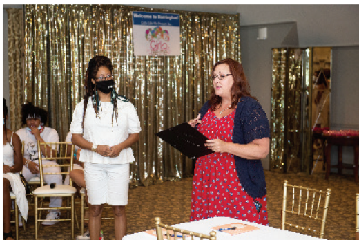
Village of Barrington presents a Proclamation.