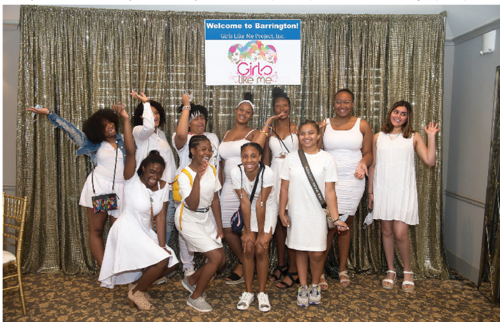
The girls enjoyed some glamour.