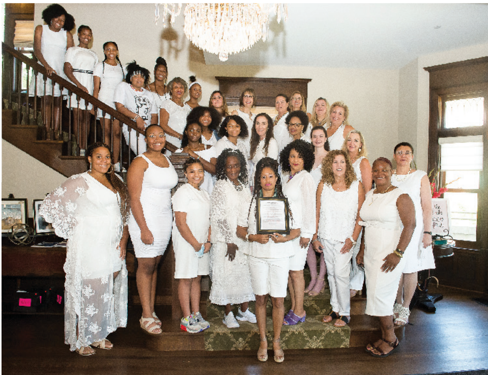
Barrington businesswomen supported the retreat.