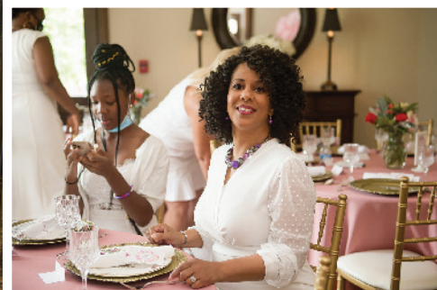
TV talk show host Tracy Sanders Campbell.