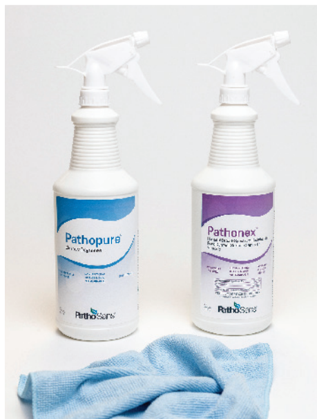
PathoSans products are available for consumers.