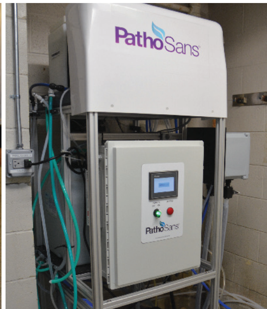
The PathoSans product-making machine at BHS.