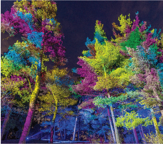
The 9th annual Illumination is a perfect melding of nature + technology + art for a safe holiday outing.