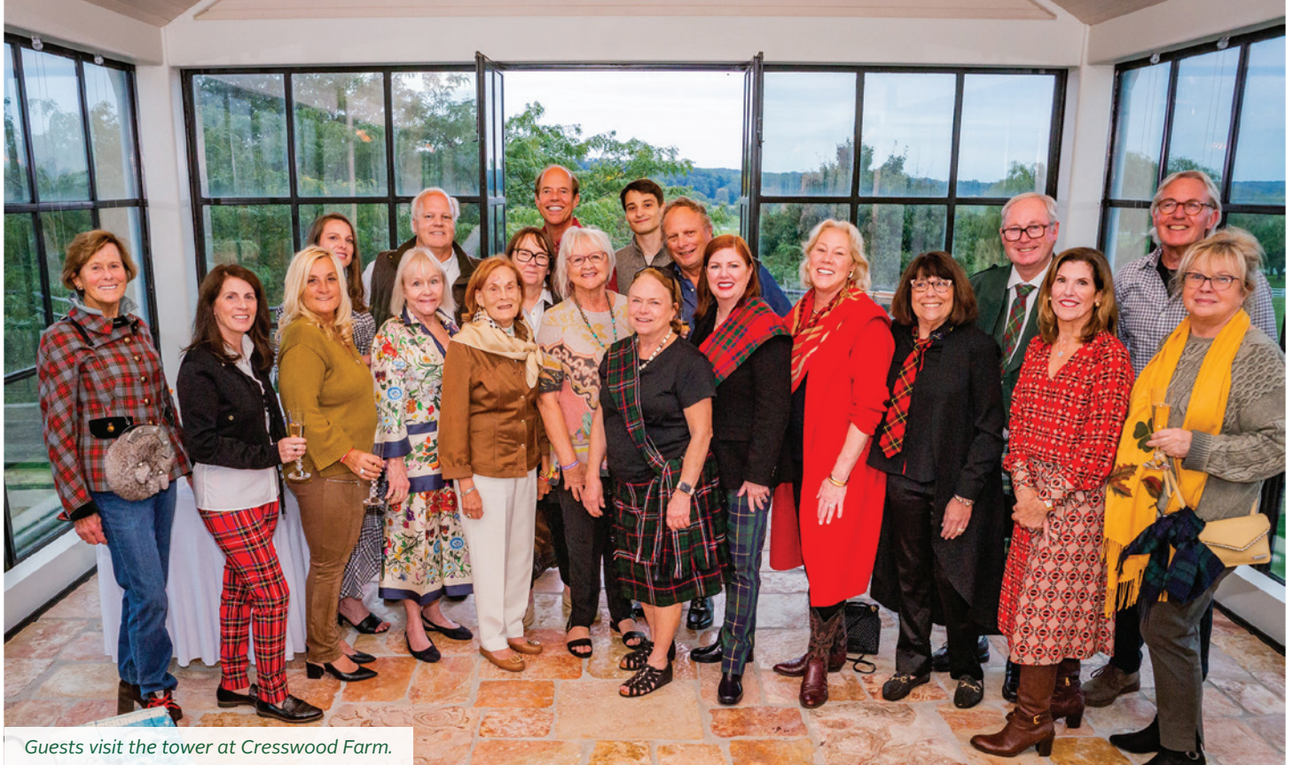
Guests visit the tower at Cresswood Farm.