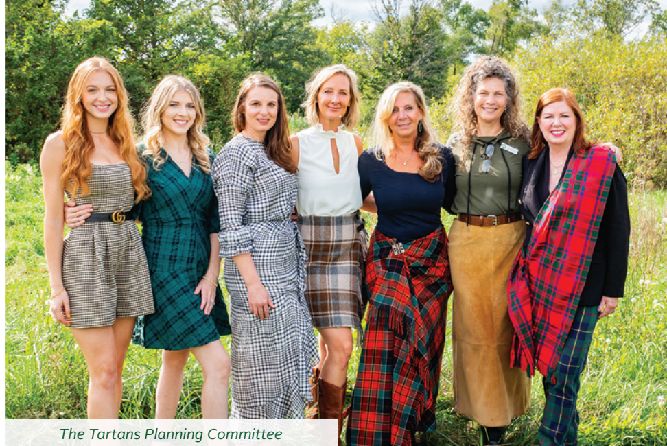
The Tartans Planning Committee