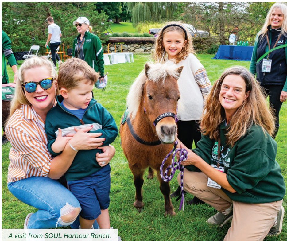
A visit from SOUL Harbour Ranch.