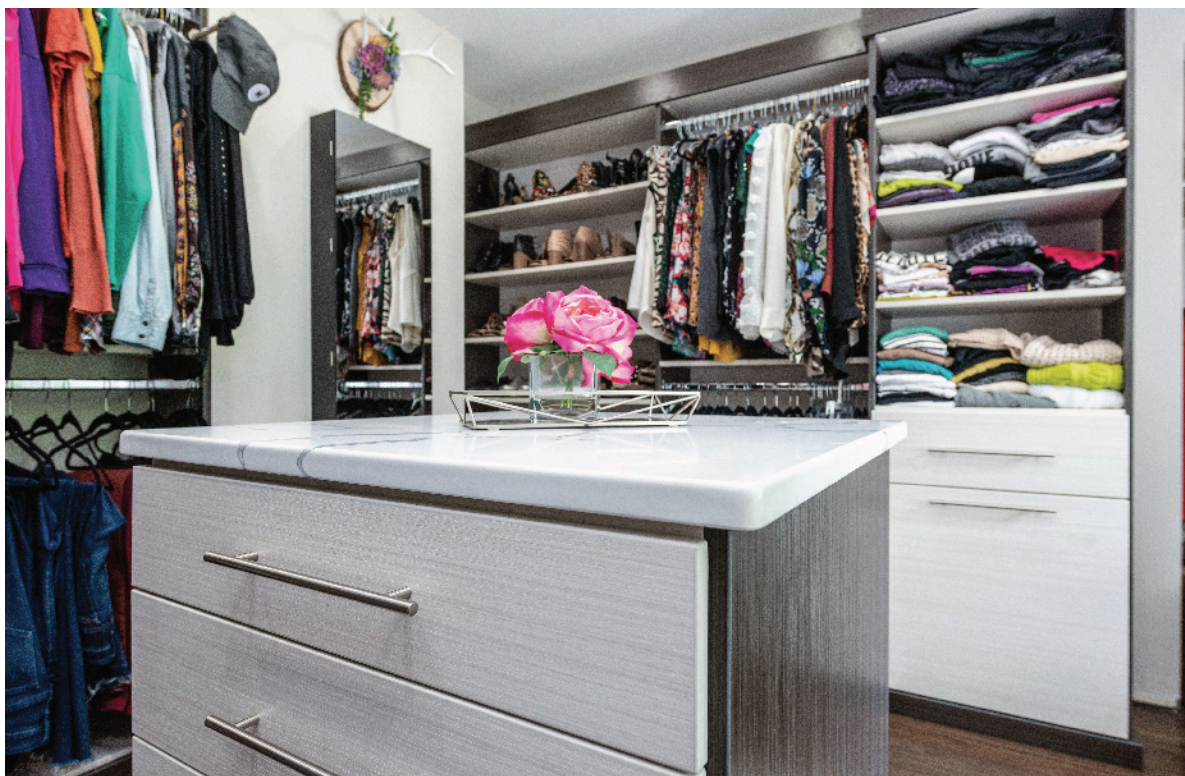
Barrington Hills homeowners worked with Closets By Design to turn a fourth bedroom in their home into a clothes closet. A contemporary crown adds elegance. The center drawer unit showcases contrasting tones and a mirrored jewelry storage unit completes the design.