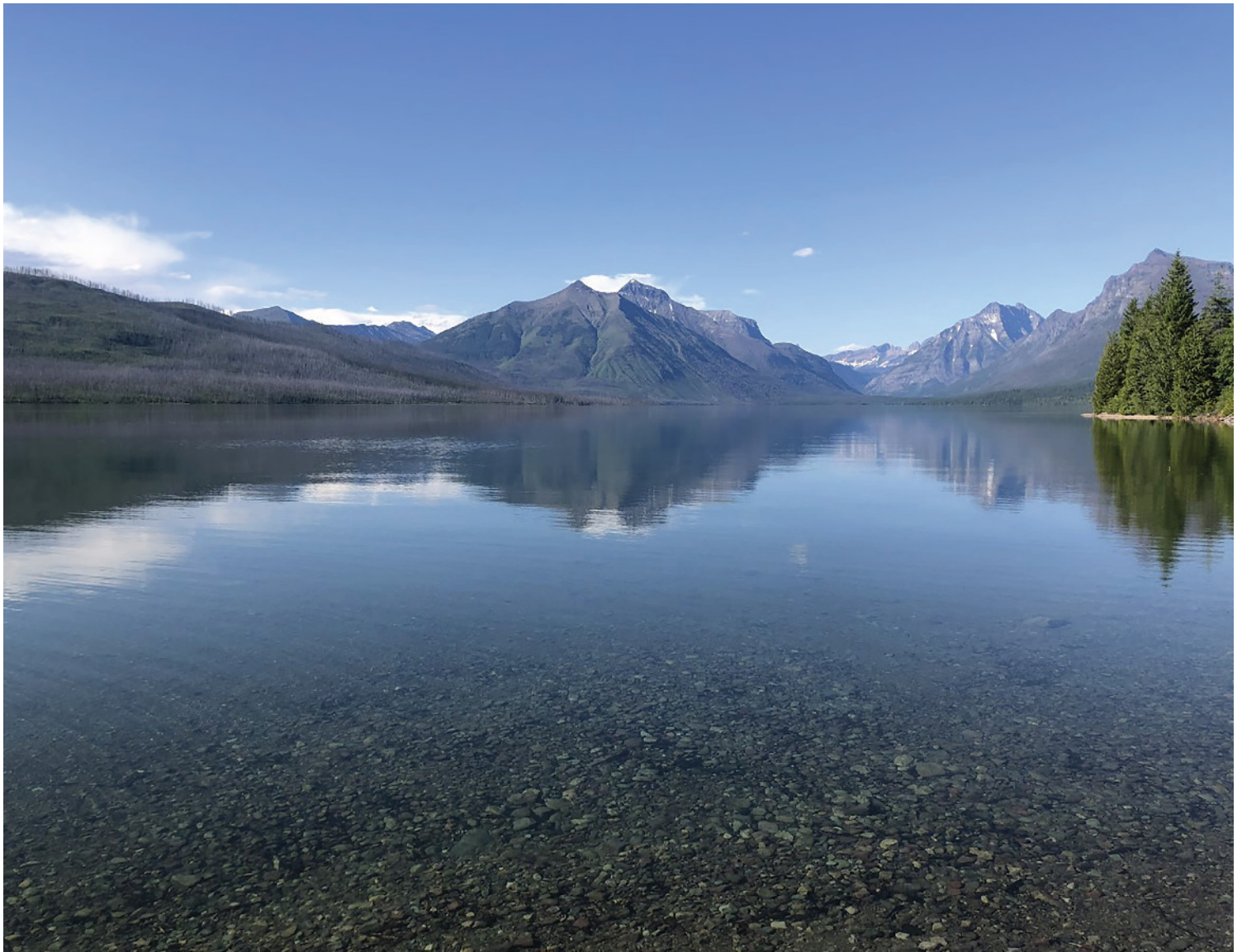
Lake McDonald in Glacier National Park, Montana.