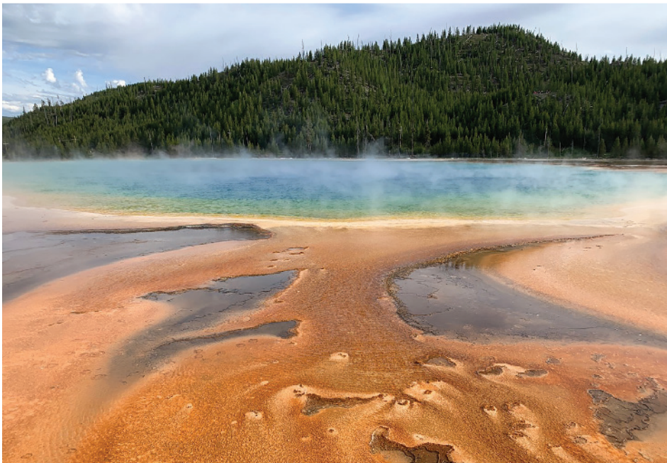
Grand Prismatic Spring, Yellowstone National Park, is the largest hot spring in the United States.