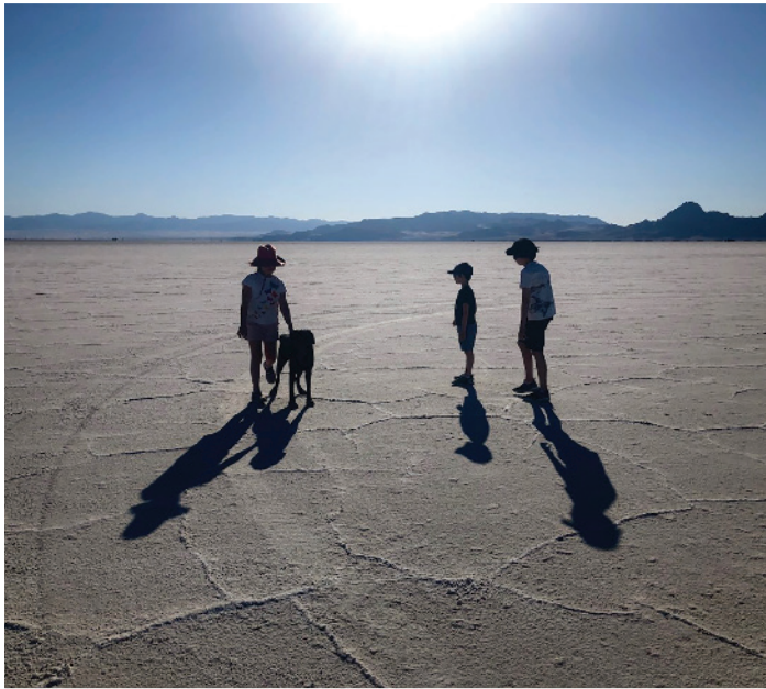
The Czerw children and Rufus at the Bonneville Salt Flats in Utah.