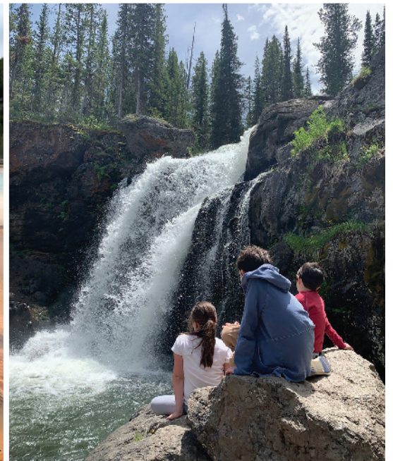
Czerw children at Moose Falls, Yellowstone National Park