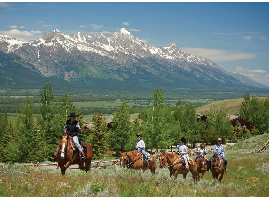
Trail riding at Spring Creek Ranch in Jackson, Wyoming.