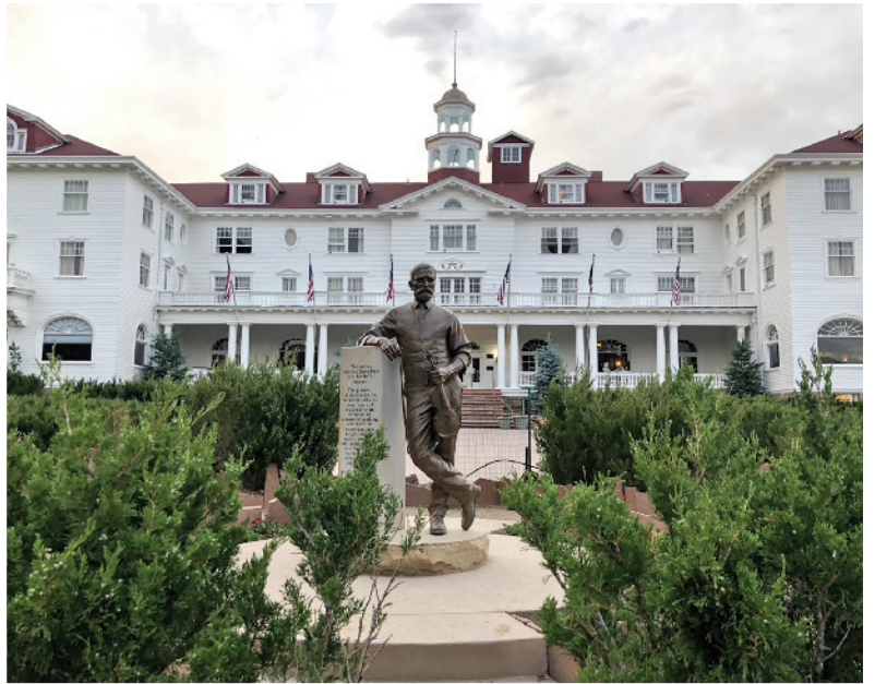
The Stanley Hotel in Estes Park, Colorado.