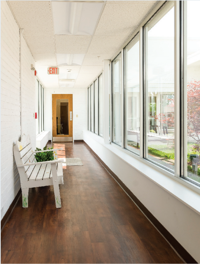
A bright and cheery glass corridor connects the Reading Room with the main building.

Ye shall know the truth, and the truth shall make you free.