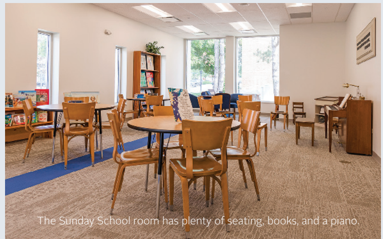
The Sunday School room has plenty of seating, books, and a piano.