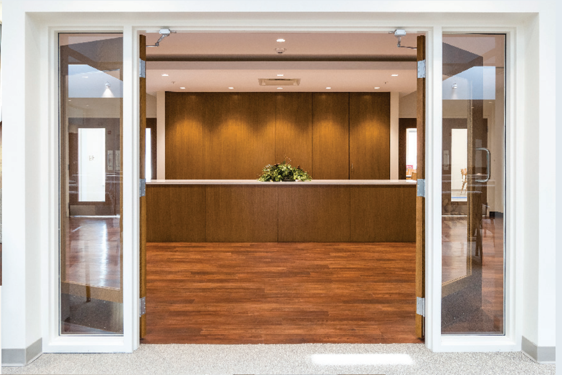
Above: The foyer's tall cabinets open up into a kitchenette for fellowship gatherings.