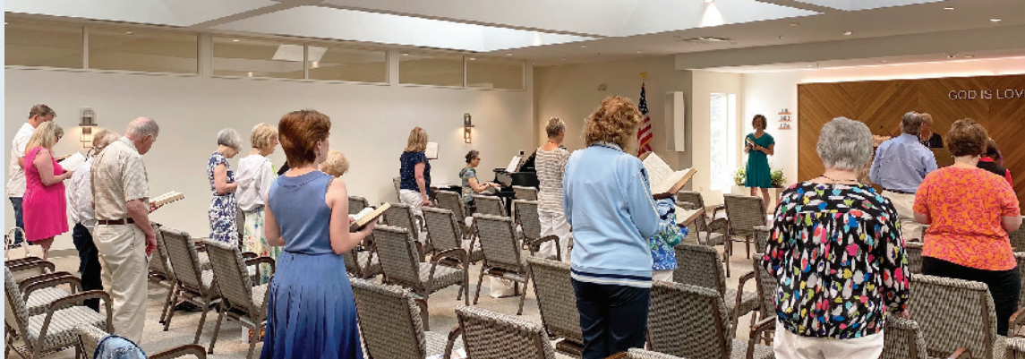
Left: The auditorium offers comfortable space for the Readings.