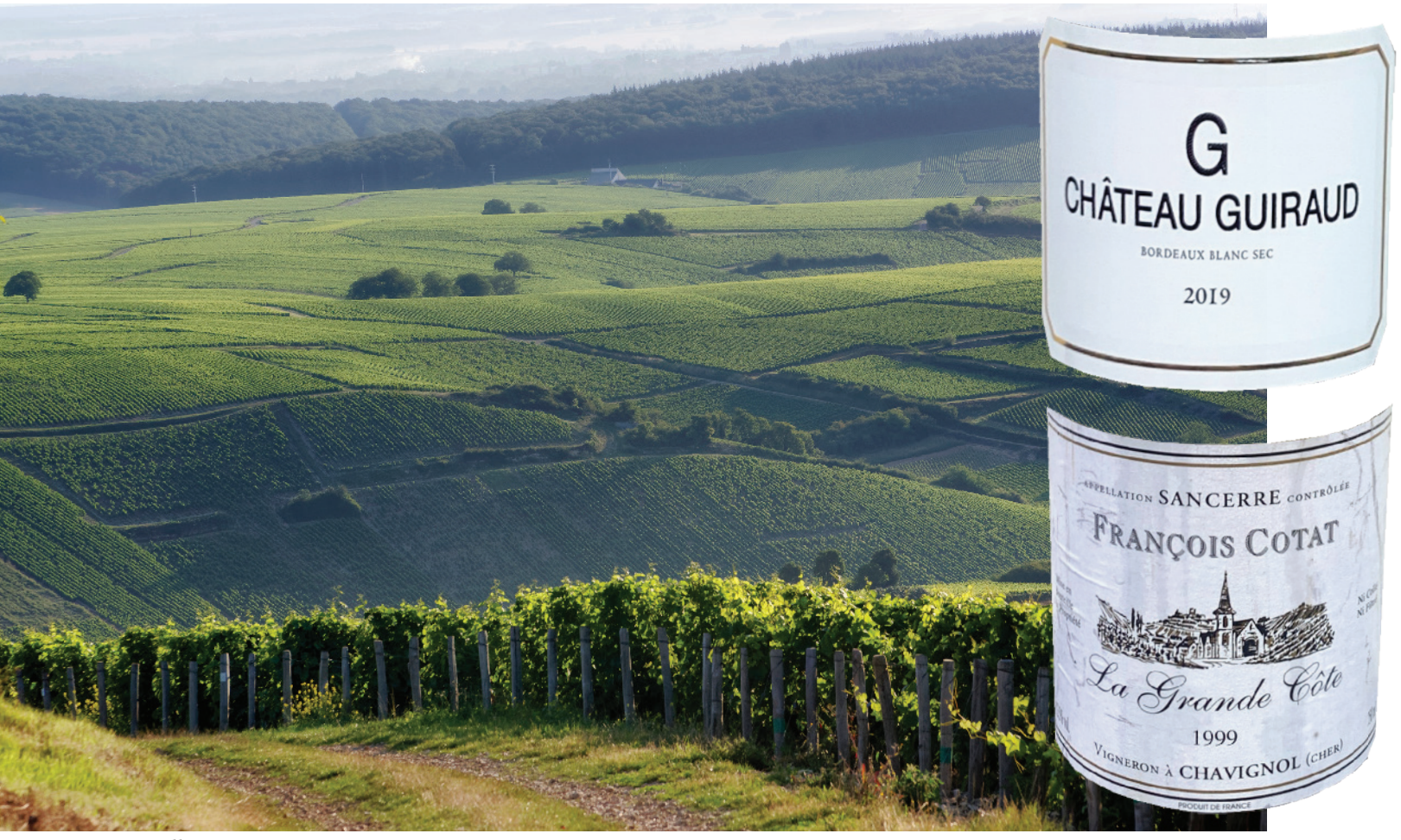
Loire Valley, France